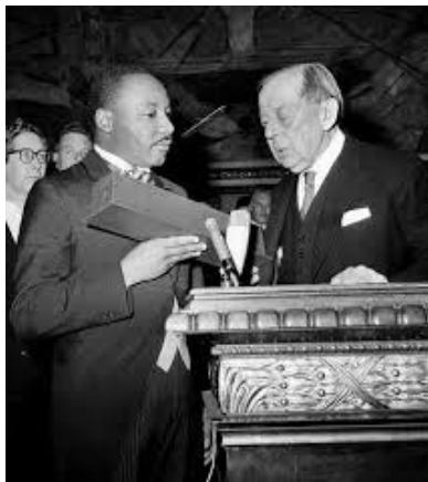
Dr. Martin Luther King, Jr. receives Nobel Peace Prize (1964)