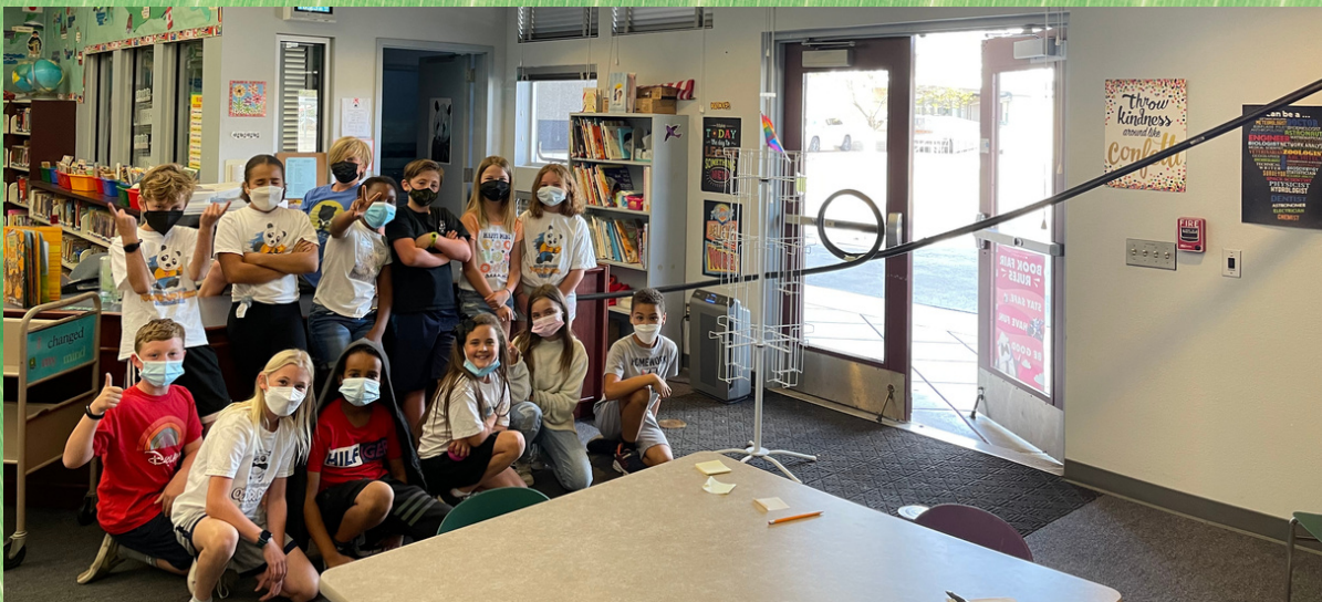
A Roller Coaster for Marbles by M.E.E.T (Mini c EEI team)Electric Eel)

M.E.E.T is a marble roller coaster building team of Fourth Grade students. M.E.E.T was formed by the students of B10.